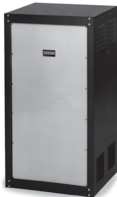
Optional Model IC-224118 Indoor Cabinet